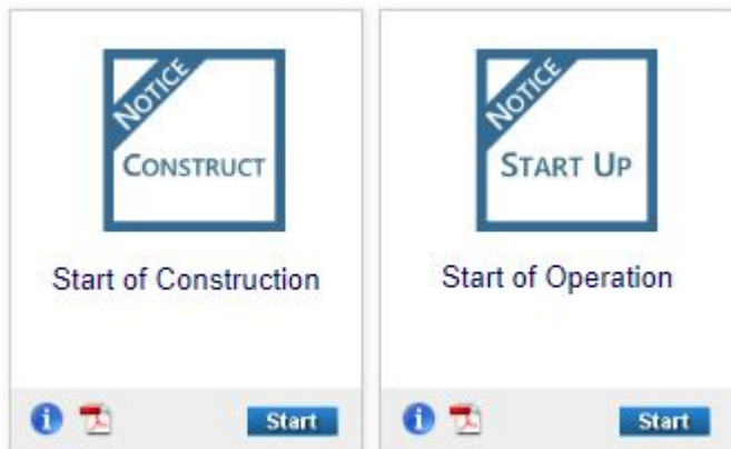
Figure 4: Start of Construction and Start of Operation Notices in Iowa EASY Air