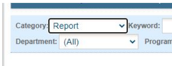
Figure 3: Select submittal category